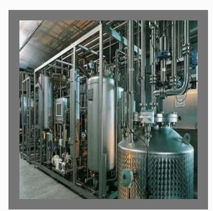
Process Automation Services