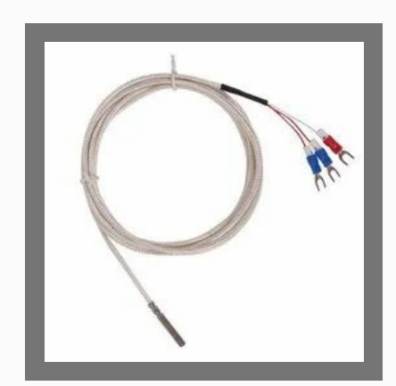
Type S Thermocouple