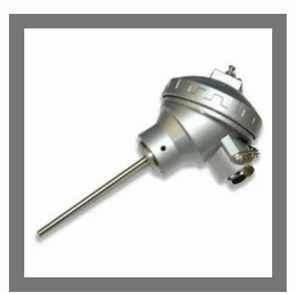
R Type Thermocouple