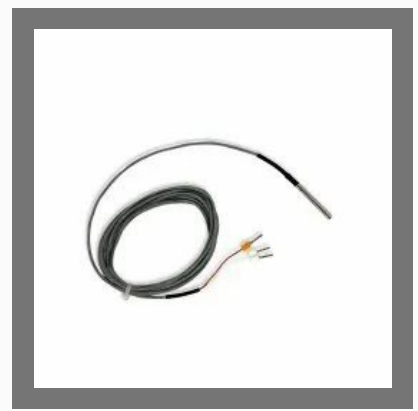
N Type Thermocouple