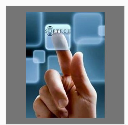
Industrial Automation System