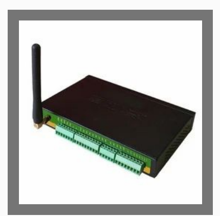
Gsm Gprs Modems