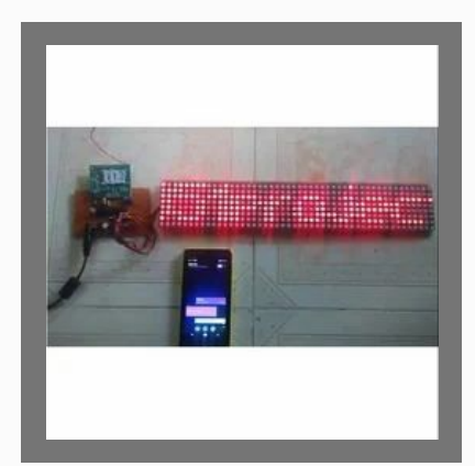
GSM Digital LED Sign Board