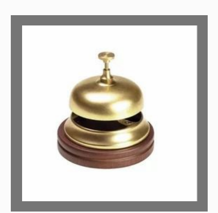
Complaint Management Service