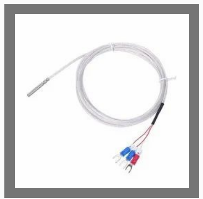
K Type Thermocouple