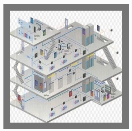
Building Automation Services