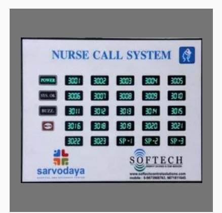
Nurse Call System