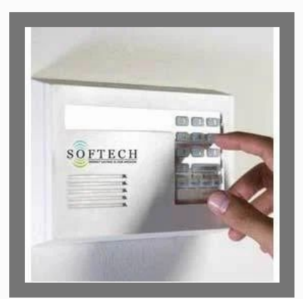
Building Management System Service