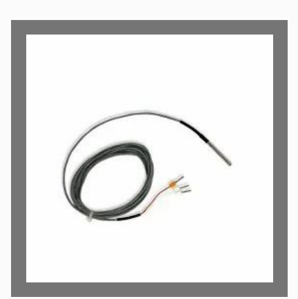
Thermocouple E Type